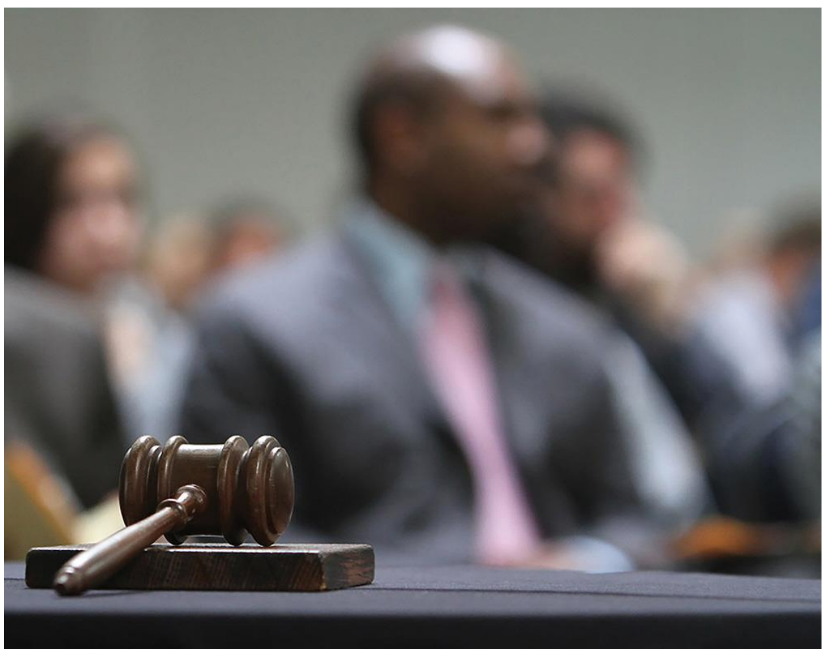
Anglophone common law lawyers claimed they were appalled by the gradual phasing out of common law principles in Cameroon's legislation.

However, many Cameroonians, especially those from the English-speaking regions, strongly deplore any of these claims that disparage the Anglophone problem. They reference cases of marginalisation, including under-representation in strategic positions of government and downright exclusion from others.