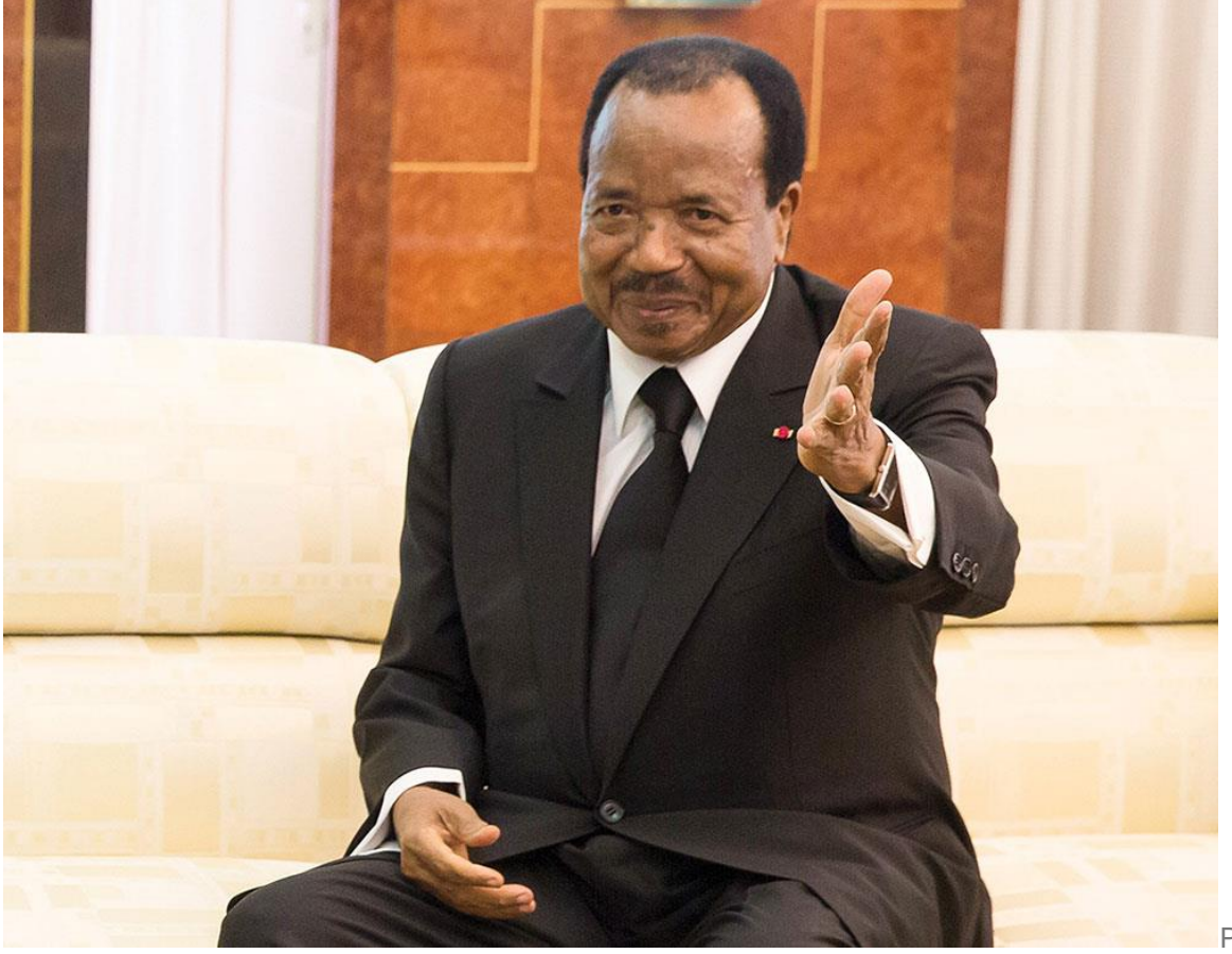
Paul Biya of Cameroon.

With the creation of the United Nations (UN) in 1945, the territories changed in status from mandated territories of the League of Nations to trust territories of the UN. A very significant ramification of this change of status was that the trust territories were to be administered in preparation for self-government.