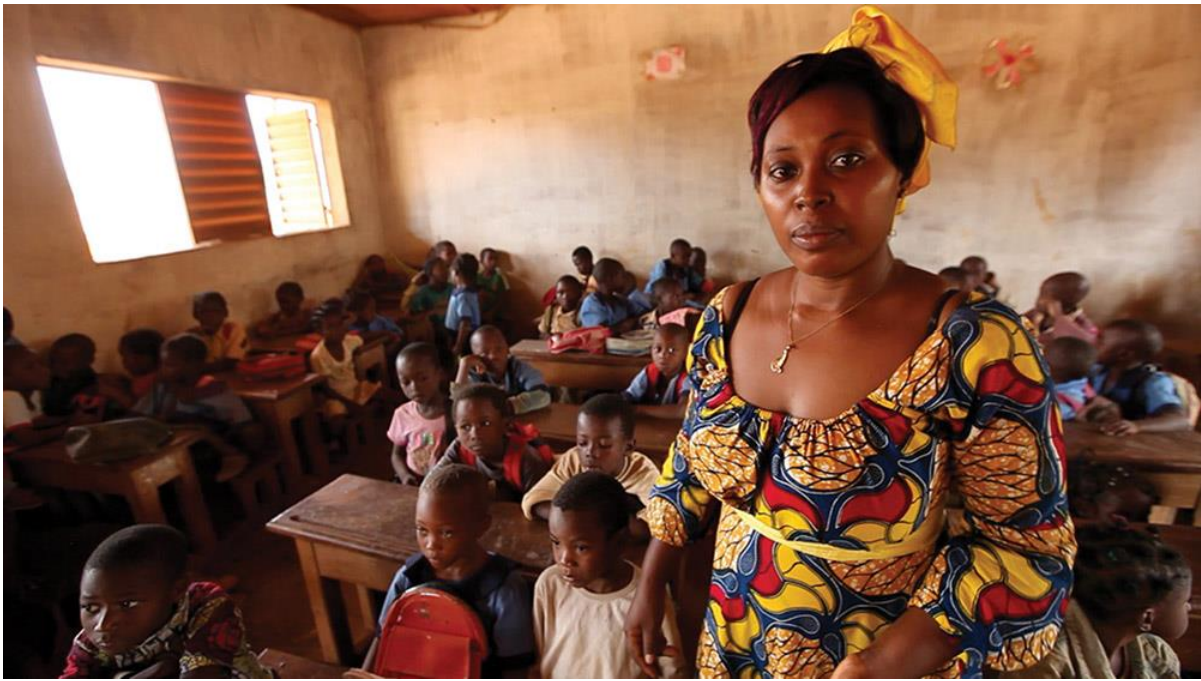
Anglophone teachers called for the redeployment of French-speaking colleagues from Anglophone regions.

The CACSC remained implacable and refused to lift the call to strike, insisting on having a two-state federation as the best way to guarantee their demands. In addition, they called for civil disobedience and a shut-down of all economic activities in the two Anglophone regions.