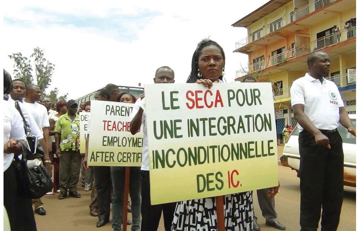
The teachers' and lawyers' unions have joined together and insist on a two-state federation in Cameroon as the best way to guarantee their demands.

In recent months, the "Anglophone problem"<sup>1</sup> has dominated politics in Cameroon, following strike action initiated by lawyers and teachers in the two English-speaking regions of the country. On 11 October 2016, Anglophone lawyers commenced a sit-down strike after having petitioned the government to address their grievances, without success.